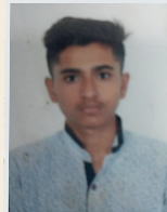
NEERAJ BIRLASOFT PACKAGE: 18 LAC PA BCA