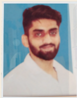
DAWAN LINK INFOTECH PACKAGE: 18 LPA BCA